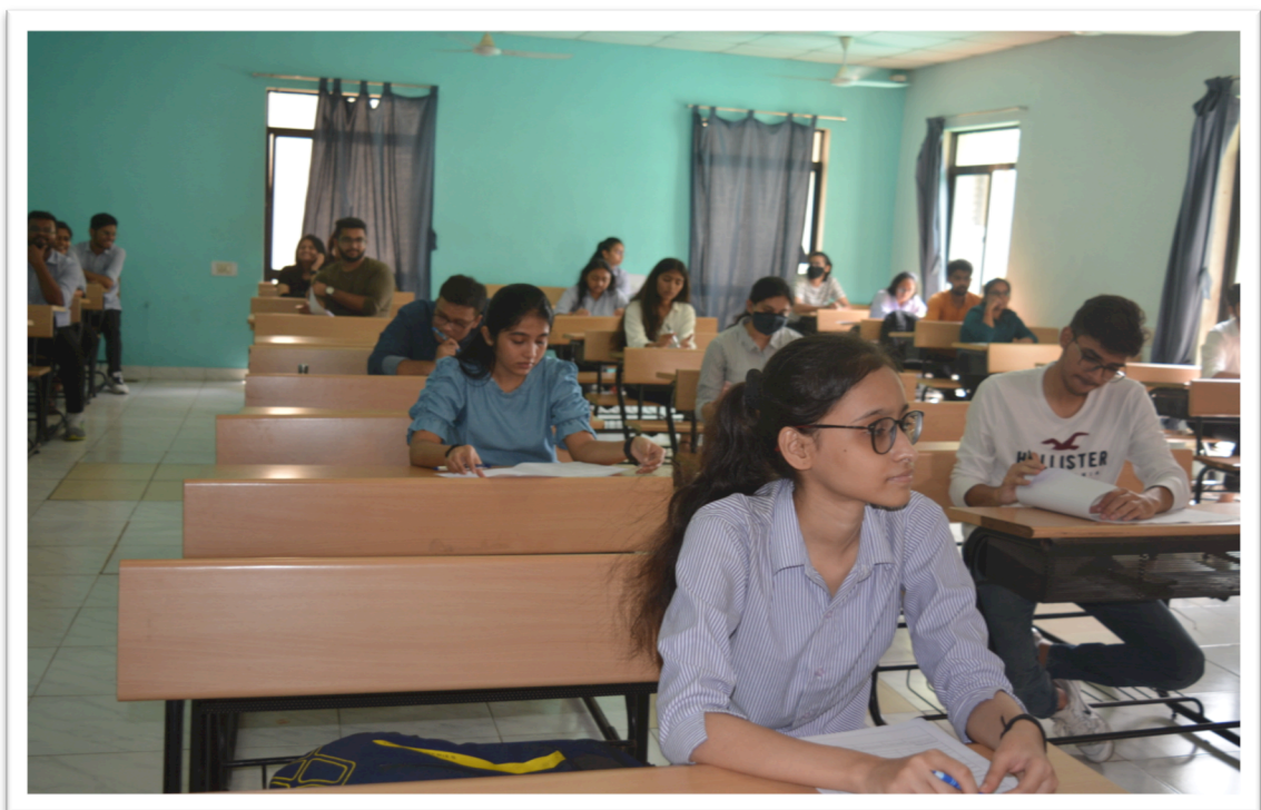
ADR Identification and Assessment