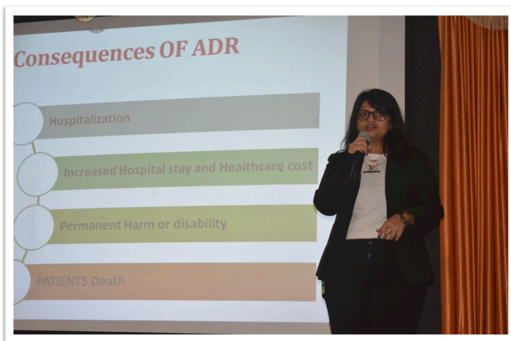
Pharmacovigilance and ADR reporting awareness session